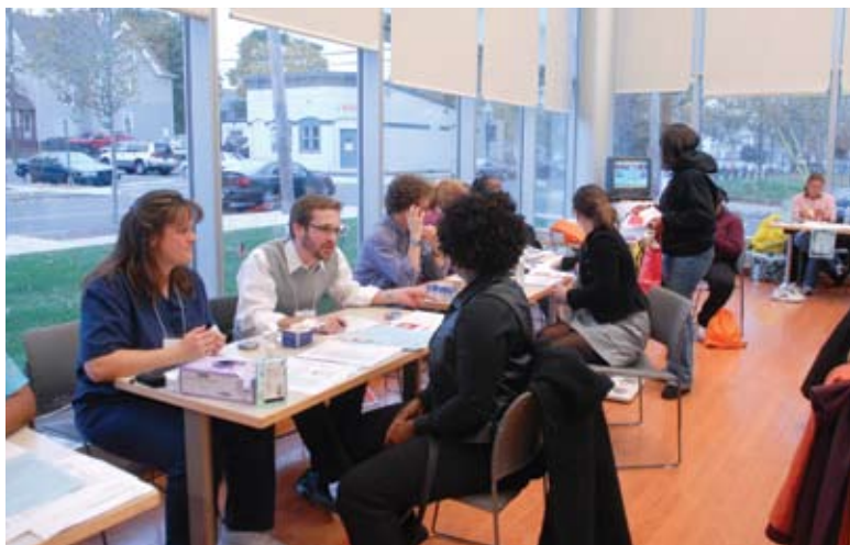
Above: Yale Care Diabetes Awareness Day event