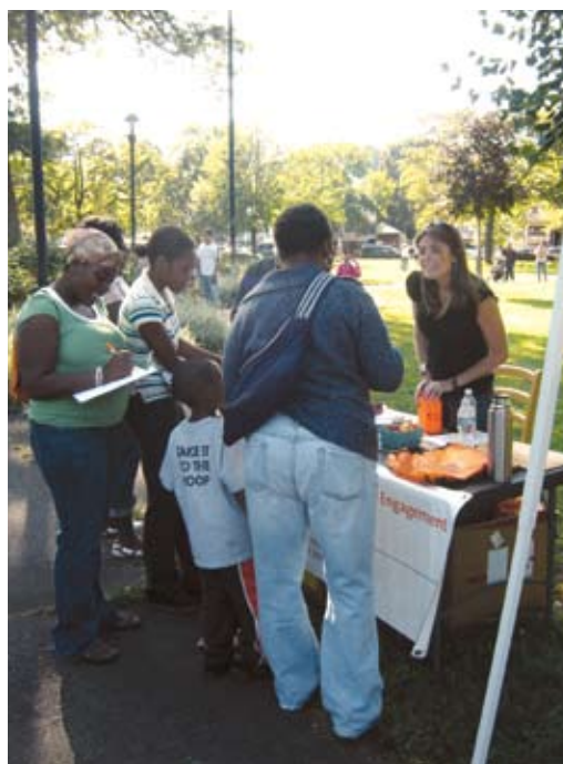
Right: Yale CARE team at the Chatham Square Neighborhood Association Festival in New Haven.