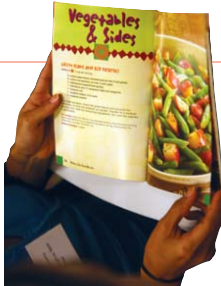
Resources for healthy eating were distributed at the Summit.

Over 60 people attended the summit, and there have been numerous news articles related to the Summit. In addition, several of the churches represented by the attendees are working to establish a SisterTalk Hartford group for the women in their congregation.