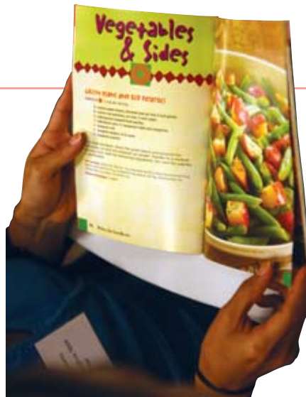
Resources for healthy eating were distributed at the Summit.

Over 60 people attended the summit, and there have been numerous news articles related to the Summit. In addition, several of the churches represented by the attendees are working to establish a SisterTalk Hartford group for the women in their congregation.