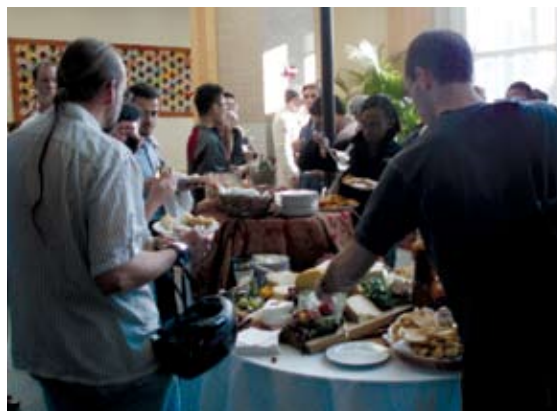
The Foundation’s guests at the lecture enjoying the reception that followed.