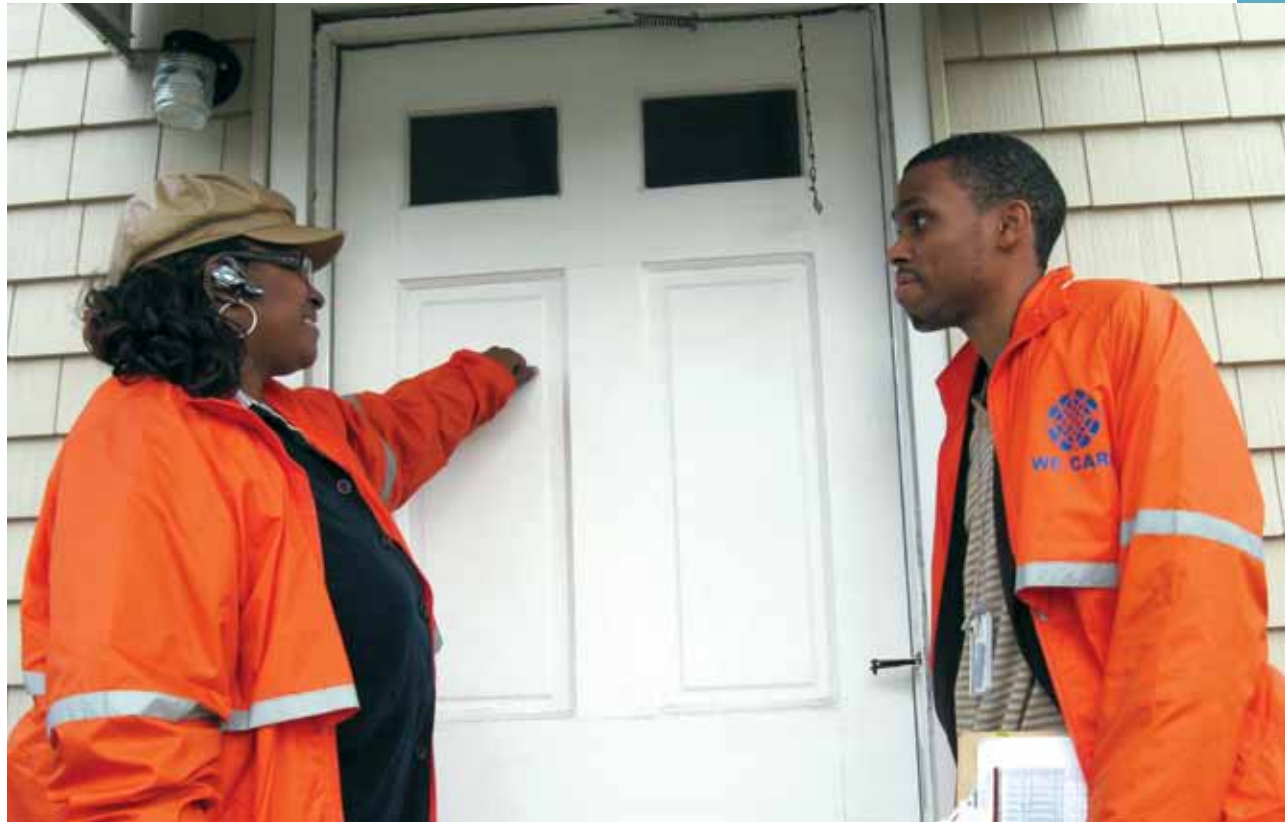
Two CARE surveyors knock on the door of a health survey respondent in New Haven.

for this one specific task. "We realized that we could hire five people and do this over eight months or hire 20 people and have it done in two months," said Santilli. In addition, the people who were hired as surveyors were from diverse populations who reflected the sampled neighborhoods and schools; in fact, many of them lived in those neighborhoods. Every household received a letter explaining the survey, and fliers about the project were circulated in the neighborhoods, with additional outreach occurring the week before the surveyors would begin in a new neighborhood. "We were