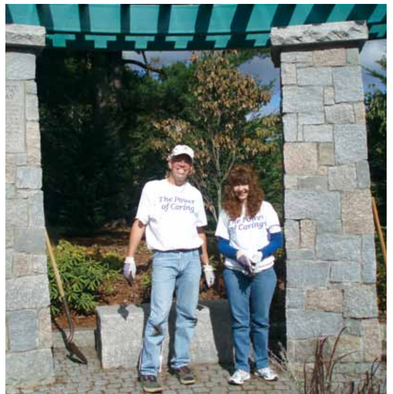
Volunteers from Northeast Utilities work with the Friends of Elizabeth Park to help maintain the park grounds.