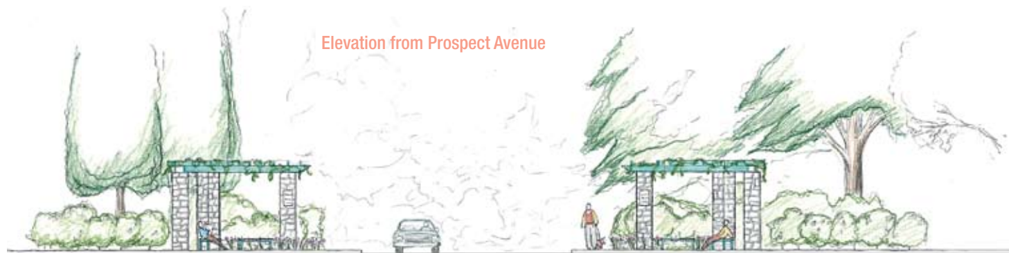
Elevation from Prospect Avenue

three stone pillars supporting a trellis; sidewalks and marked crosswalks will be established to promote safer pedestrian traffic into the Park, and a row of trees will be planted along the west edge of Prospect Avenue, which with the trees along the east side will create an arched canopy along the street. The second project is a small, quiet sitting area at the junction of existing paths near the Park's pond. An oval of granite pavers will mark the area where the paths meet and a rustic stone bench will allow Park visitors to pause and sit facing the pond.