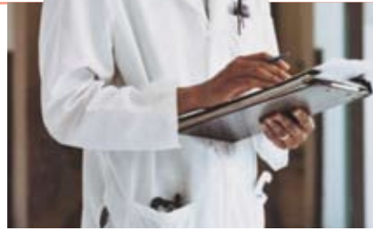
Atul Gawande, MD will speak at the Foundation's annual meeting on Wednesday, April 23, 2008

A panel will follow Dr. Gawande's talk showcasing selected case studies of research being put to work.