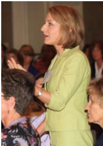
An audience member poses a question to the panel.