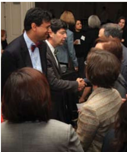
Audience members chat with keynote speaker Atul Gawande

Many of the Foundation’s past and current grantees attended the meeting and 2007 Donaghue grant awardees were recognized, as well as Foundation policy and science advisers who had served for either five or ten years on Foundation committees. Several media outlets including WTNH-TV, the Danbury News Times, The Hartford Advocate and radio stations WDRC and WTIC covered the “Beyond Eureka” conference running pieces about the meeting and the work of the Donaghue Foundation.