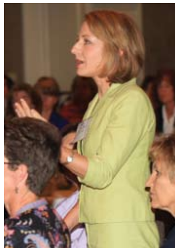
An audience member poses a question to the panel.