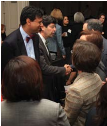
Audience members chat with keynote speaker Atul Gawande